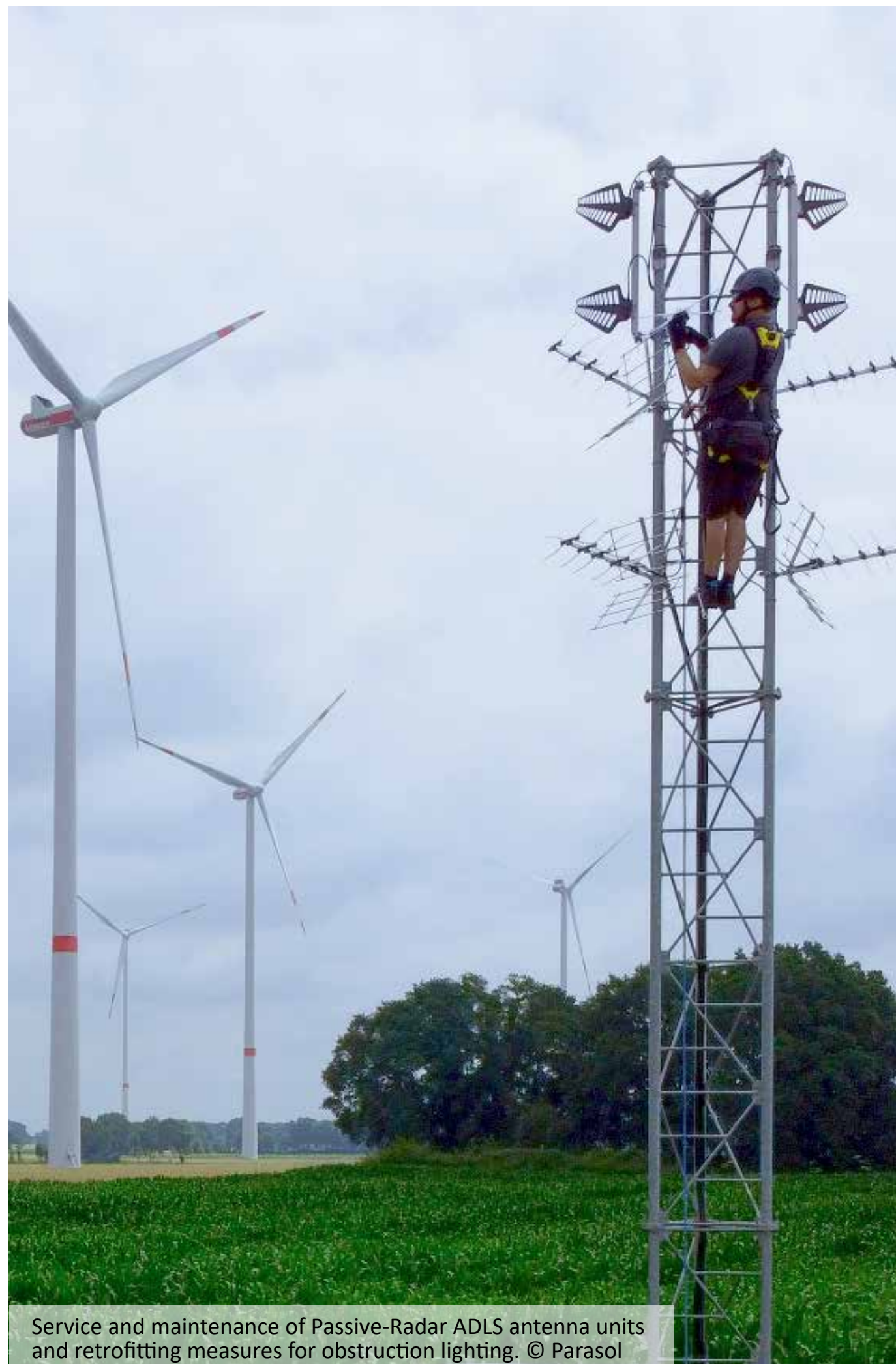
Service and maintenance of Passive-Radar ADLS antenna units and retrofitting measures for obstruction lighting.

Many of these systems are currently operated for aviation and are very popular because of their high precision and security as well as exact detection and easy installation without emitting their own signals. Such systems can be adjusted to new requirements in parallel. It is therefore possible at any time to adjust the detection area of the system to meet future ICAO and EASA requirements for such ADLS systems.